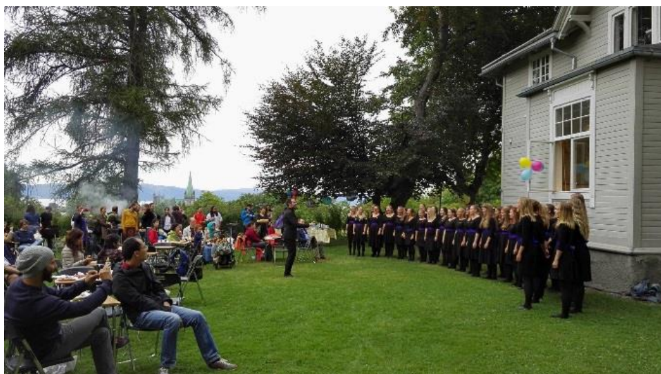
Entertainment by Trondhjems kvinnelige studentersangforening (TKS)

Approximately 70 people attended the event.